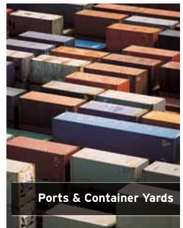
Ports & Container Yards