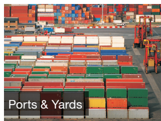
Ports & Yards