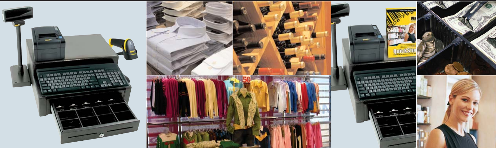
Big Business Tools. Small Business Attitude.

Additional components for your point of sale solution are available for purchase separately.